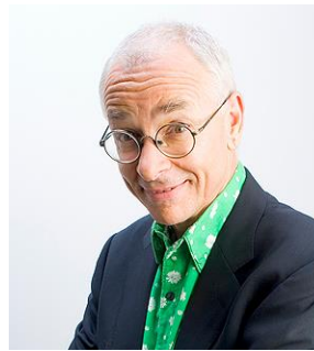
Dr Karl Kruszelnicki