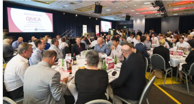
QMCA Industry long lunch 2017