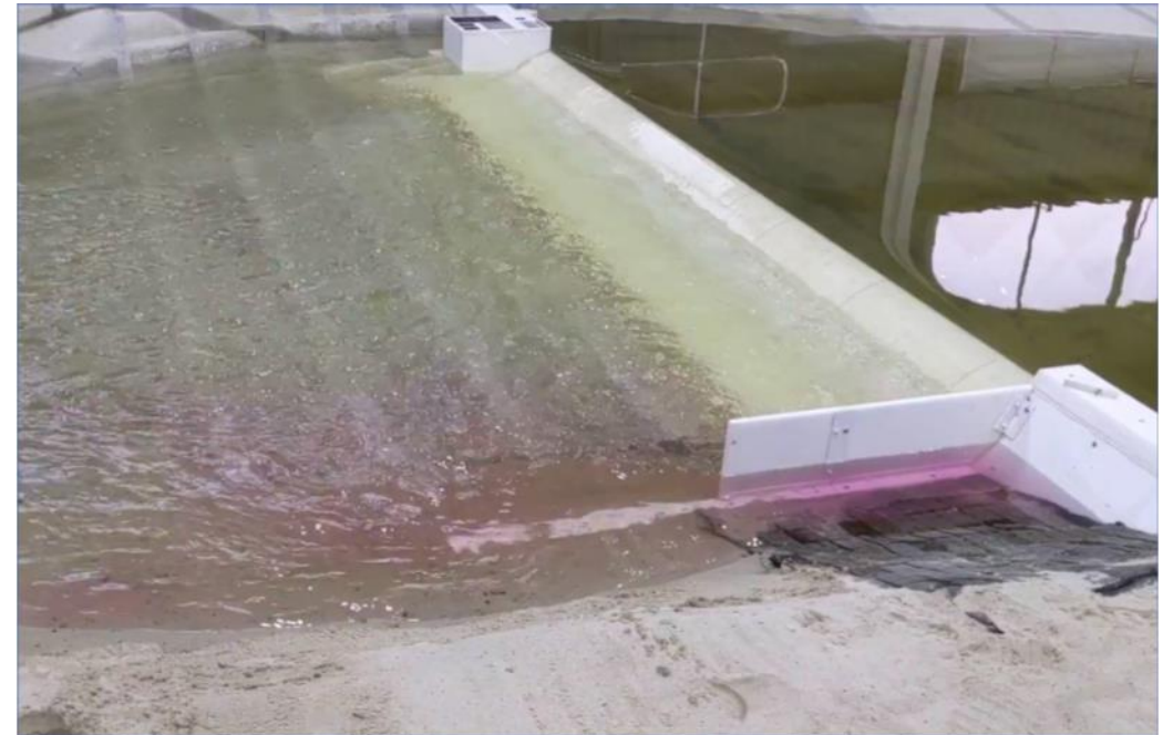
Physical model – Sunwater Hydrology Lab